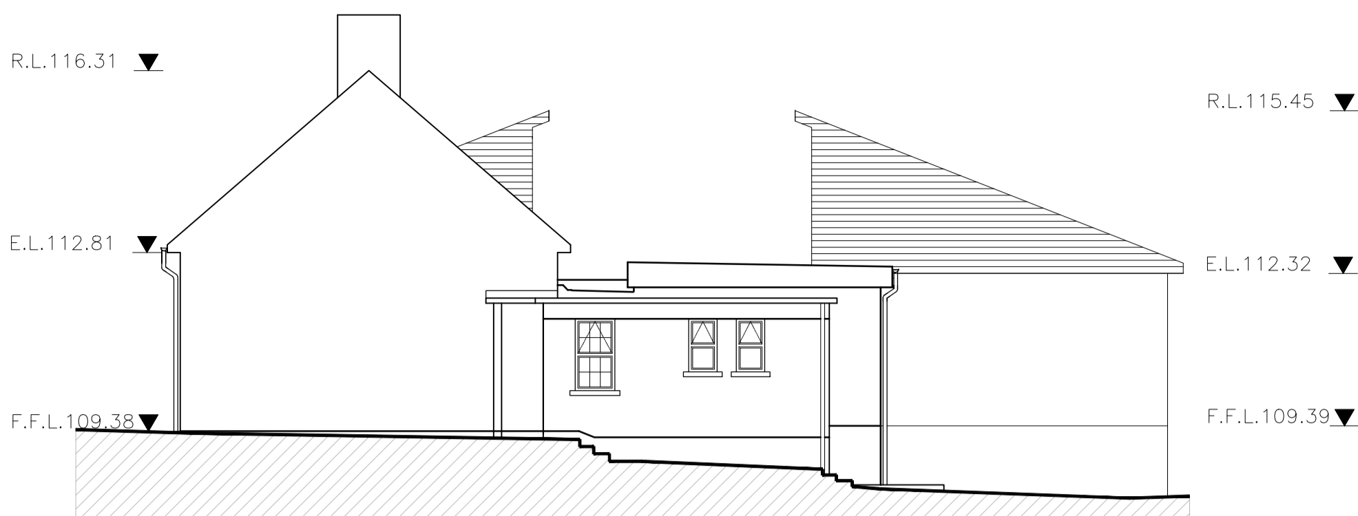
1 NORTH EAST ELEVATION- As Existing

Refer to Building Services Engineer's drawings and documents for all Mechanical and Electrical works in this project.