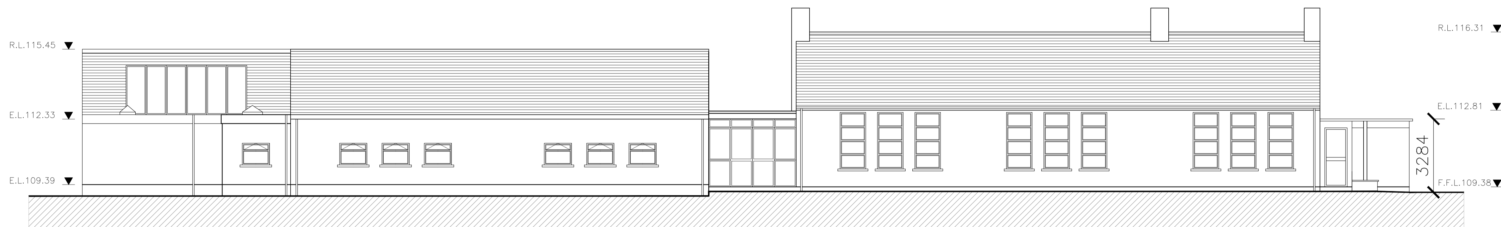
2 SOUTH EAST ELEVATION- As Existing