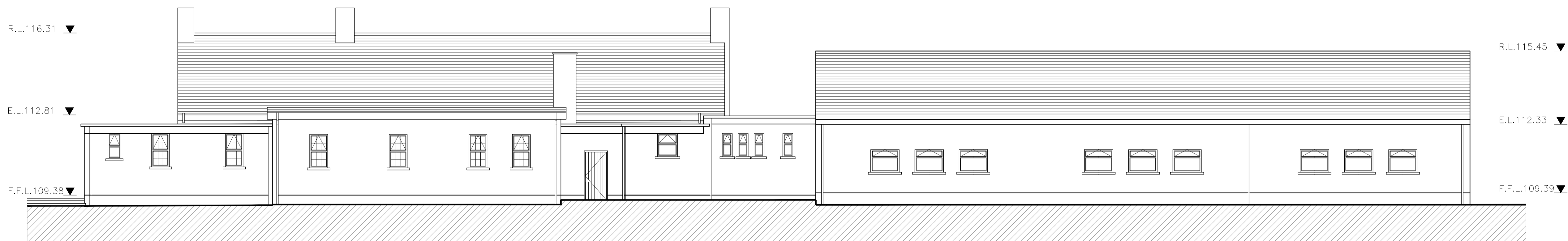
3 NORTH WEST ELEVATION- As Existing