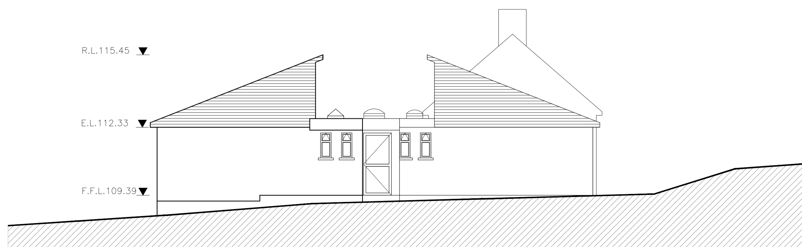
4 SOUTH WEST ELEVATION- As Existing